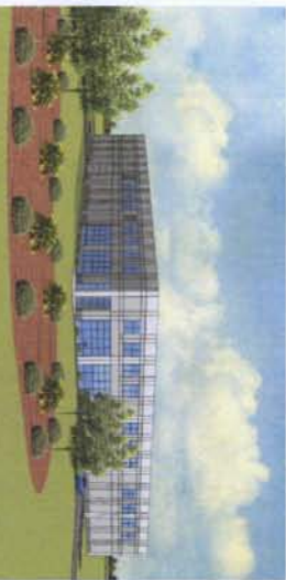
LENOIR COUNTY ED SHEIL BUILDING MONTHLY EXTENSION PERSPECTIVE

Wastewater Service provider: City of Kinston Line size: 12" (at the property) Available line capacity: 0.7 gpd Current downstream capacity: 0.2 MGD with future expansion planned for additional 1.0 MGD